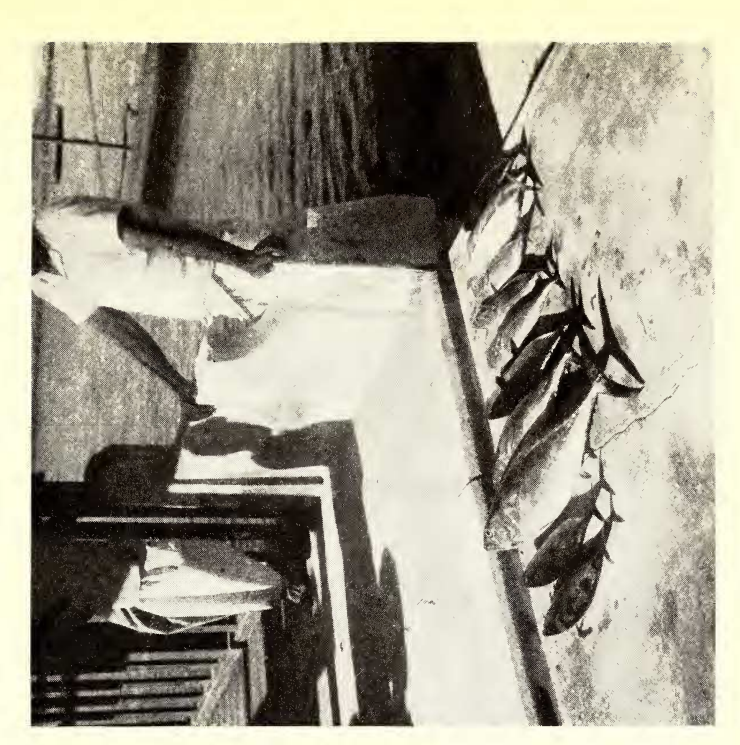
Bonito (Enthynnus sp.) caught in the lagoon of North Malé Atoll